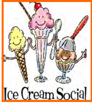
Ice Cream Social

July 1 (Sat) 8:00 am First Saturday BS Breakfast, Denny's Restaurant, 2314 17th St, Santa Ana, CA